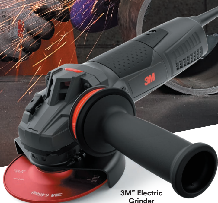
3M™ Electric Grinder